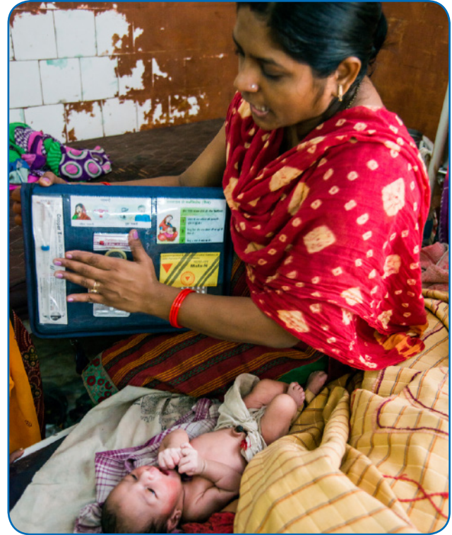
Mothers and their newborn children in the post natal ward at the district hospital in Arrah, Bihar.

Offering modern contraception services as part of care provided during childbirth increases postpartum contraceptive use and is likely to reduce both unintended pregnancies and pregnancies that are too closely spaced. 1,2 Unintended and closely spaced births are a public health concern as they are associated with increased maternal, newborn, and child morbidity and mortality. 3-5 After a live birth, the recommended interval before attempting the next pregnancy is at least 24 months, based on a consultation convened by the World Health Organization (WHO), in order to reduce the risk of adverse maternal, perinatal, and infant outcomes. 6 Despite this evidence, 61% of women are not using effective contraception within 24 months postpartum to avoid an unintended pregnancy. 7