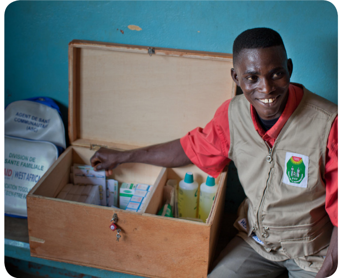
A community health worker in Togo with his lockbox of medication and supplies.

Integrating CHWs into the health system is one of several proven “high-impact practices in family planning” (HIPs) identified by a technical advisory group of international experts. A proven practice has sufficient evidence to recommend widespread implementation as part of a comprehensive family planning strategy, provided that there is monitoring of coverage, quality, and cost as well as implementation research to strengthen impact (HIPs, 2014). For more information about other HIPs, see http://www.fphighimpactpractices.org/overview .