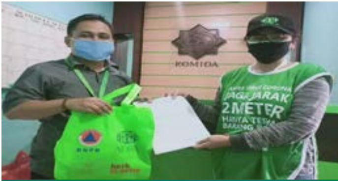
ADRA Indonesia COVID-19 RESPONSE