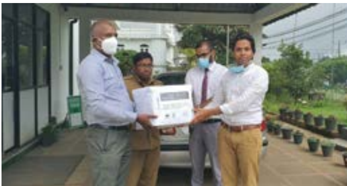
ADRA Sri Lanka COVID-19 RESPONSE