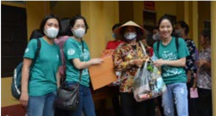
ADRA Vietnam COVID-19 RESPONSE